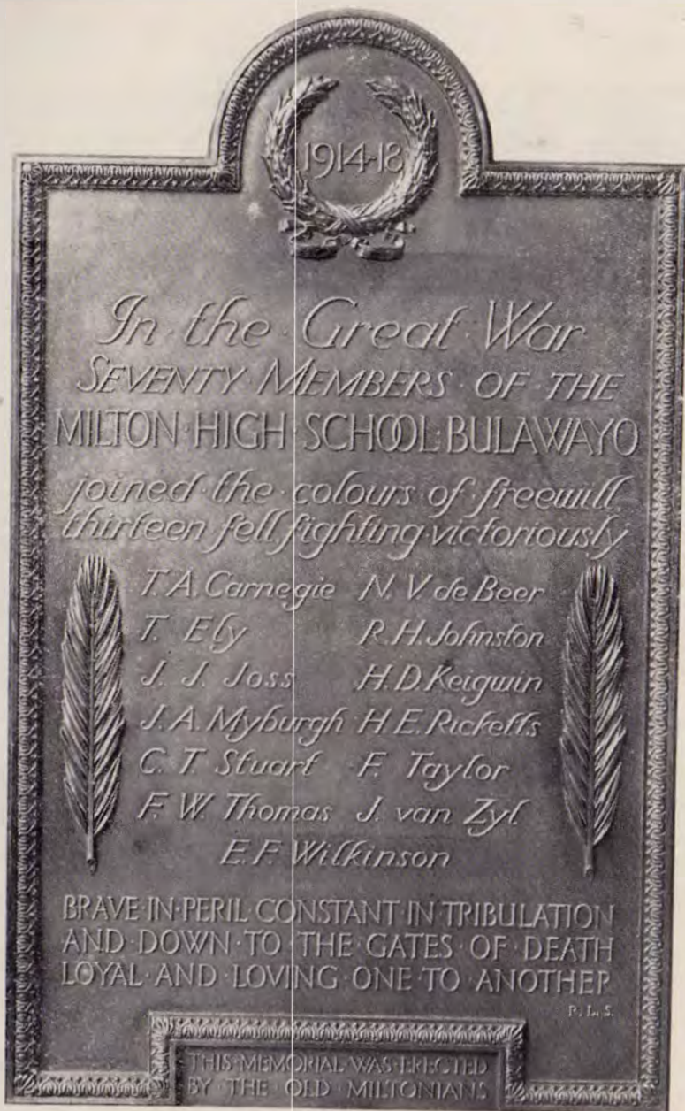
The School War Memorial.